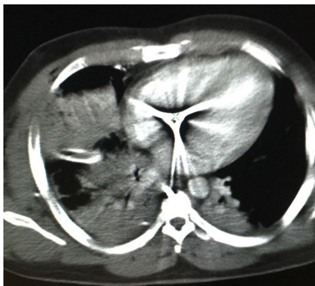
Fig. 1 - Cross-sectional chest tomography.