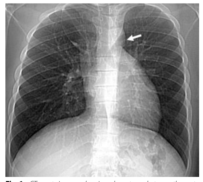
Fig. 1 – CT scout view was showing a lucent area between the aorta and pulmonary artery (white arrow).

with ECG (64-slice detector, General Electric Medical Systems) was performed to exclude the presence of anomalous pulmonary venous return. The cardiac CT revealed a right atrial appendage