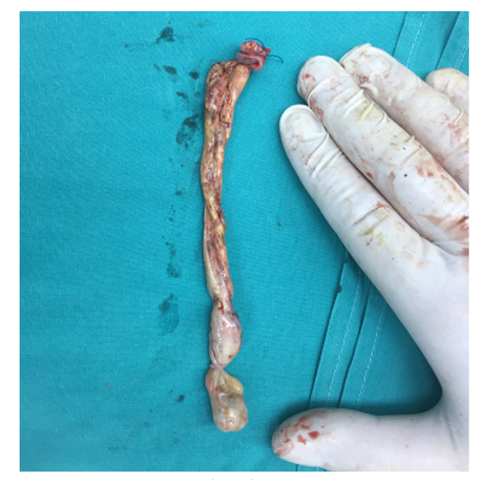
Fig. 4 - Tumor thrombus from female patient extending to the supradiaphragmatic portion of IVC.

immediately retracted in the supradiaphragmatic part of IVC in male patient and in infradiaphragmatic-suprahepatic portion of IVC in female patient, and, subsequently, thrombectomy was done. After the extraction of the thrombus the nephrectomy was done. On the control TEE there was no remnant thrombus in IVC nor the evidence of distal embolization. The site of thrombectomy on IVC was reconstructed with direct suture in both cases. Due