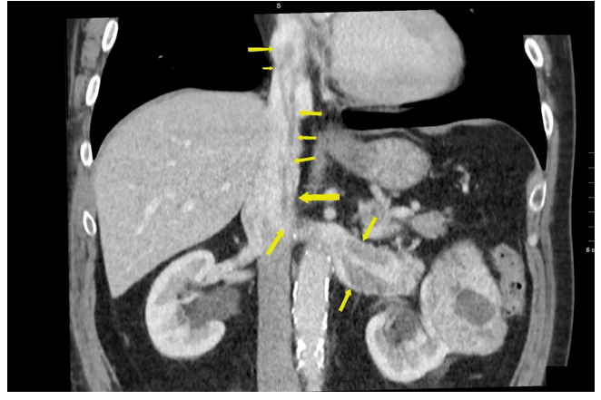
Fig. 1 - CT scan of male patient with left kidney tumor and thrombus propagation up to the right atrium.

sterno-laparotomy and partial veno-venous bypass. Following the induction of general anesthesia, internal jugular central line was inserted. In addition, a multiplane TEE probe was placed in the esophagus. Initial TEE examination of the heart confirmed the normal cardiac structures and function without a patent foramen ovale. TEE study was performed with emphasis on the hepatic veins, IVC, right side of the heart, and pulmonary arteries (PAs). The tumor was well visualized in the IVC extending proximal into the RA for male patient and supradiaphragmatic portion of IVC in female patient (Figure 2).