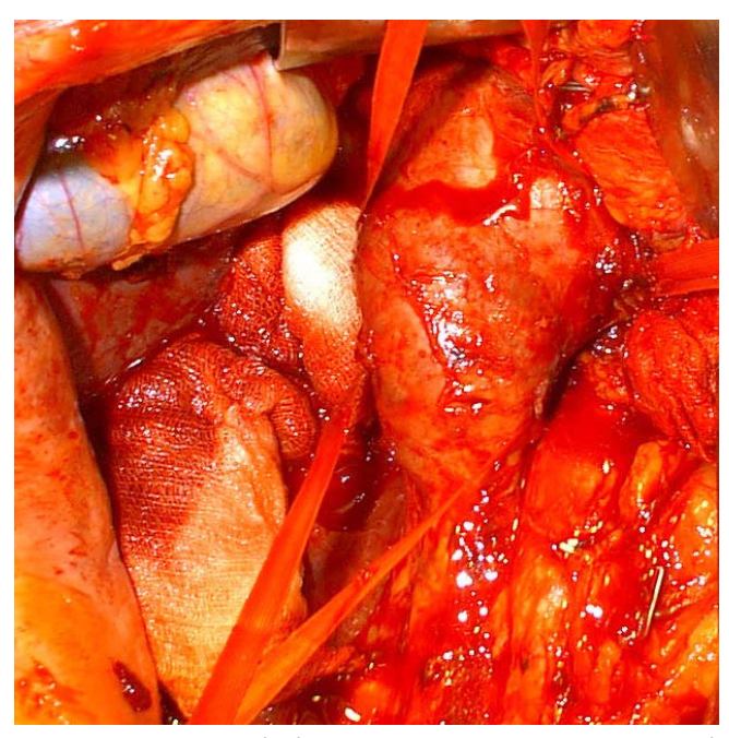
Fig. 3 - Presentation of inferior vena cava in male patient with left kidney tumor and thrombus propagation up to the right atrium.

immediately retracted in the supradiaphragmatic part of IVC in male patient and in infradiaphragmatic-suprahepatic portion of IVC in female patient, and, subsequently, thrombectomy was done. After the extraction of the thrombus the nephrectomy was done. On the control TEE there was no remnant thrombus in IVC nor the evidence of distal embolization. The site of thrombectomy on IVC was reconstructed with direct suture in both cases. Due