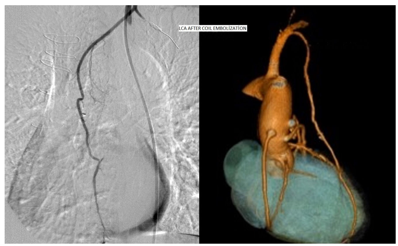
Fig. 2 - Cineangiographic and computed tomography angiographic view of the LITA after coil embolization.