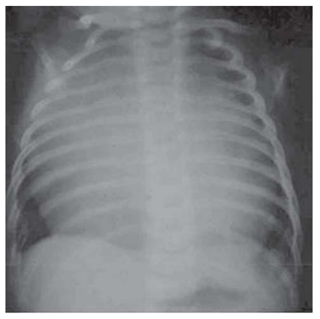
Fig. 1 – Chest radiography showing accentuated cardiac area enlargement.

superior vena cava was identified, with moderate quantity of pericardial liquid with serosanguineous aspect. The mass was adhered by slim pedicle to the anterior face of the ascending aorta (Figure 3). A resection of this mass was performed. There was good immediate postoperative evolution. The tumoral mass presented approximate diameter of 4 to 4.5cm, and was sent to anatomicopathological study, which revealed that it was intrapericardial teratoma.