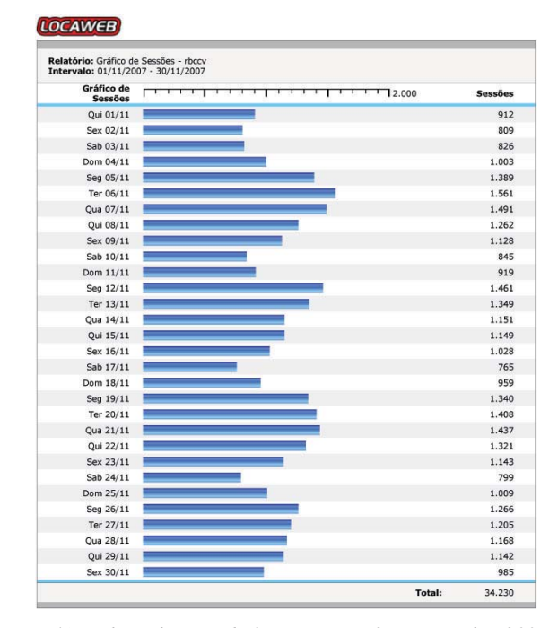
Fig. 4A – Chart showing daily visits regarding November 2007 in BJCVS/RBCCV website.

The website is continually being improved over the years in order to become more complete and easier to navigate. Its success can be evaluated by the high visit index numbers, including visits from abroad, from where BJCVS/RBCCV has received a significant number of submissions. The average reaches more than 2000 daily visits. Figures in which the visits to RBCCV and SciELO are added according to the charts below (Figure 4).