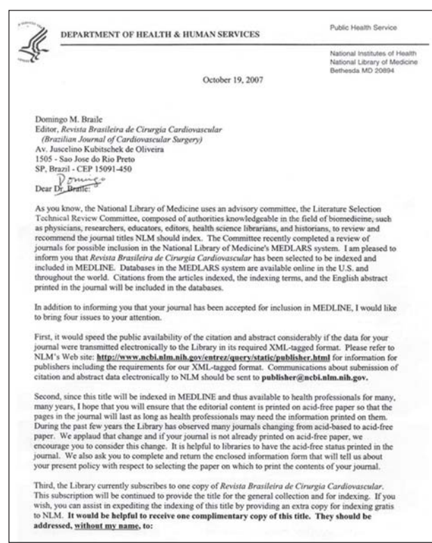
Fig.5 - Facsimile of the original communication from Medline.

The BJCVS/RBCCV editorial board, with full support of Bireme and SciELo teams to fulfil the form correctly according to Medline patterns, has devoted enthusiastically to develop the changes, refinement and format of the journal. In October 31 2007, we received a letter officially communicating that we have, at last, been accepted (Figure 5).